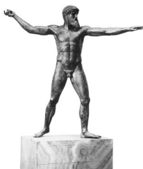
Figure 1.7 Bronze statue of a god, 2.09 m. high, usually identified as Poseidon or Zeus, from about 460 B.C.E. It was recovered from the sea near Cape Artemisium off the east coast of Greece and is now in the National Museum, Athens. For a close view of the head, see Figure 1.1 . It is this statue we use as a model for the statue of Poseidon Soter in his sanctuary at Sunium. On this statue see Robertson, A History , pp. 196–7 and Stewart, who identifies him with Zeus, in Sculpture , pp. 146–7.

east, with a door on the short, eastern side. It may, but not necessarily, have a front porch, a back porch, and a detached colonnade supporting the superstructure of the roof. The Greek term for the whole building is naos , for the central interior room megaron , but for both we most commonly use Latin-based terms, for the building temple , for the inner room cella . The columns are usually fluted, the entablature above the architrave and the pediments may be decorated with sculpture appropriate to the deity, and the roof may be surmounted with ornaments. But the central room, the cella , is our concern now, because it will house the new statue of Poseidon. He will stand