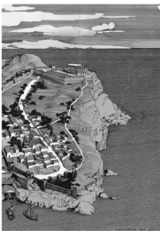
Figure 1.8 A reconstruction of the sanctuary of Poseidon Soter at Sunium and of the fort which enclosed it in the late fifth century B.C.E. 1. The temple of Poseidon Soter. 2. The gateway to the sanctuary. 3. The quarters of the soldiers and sailors manning the fort. 4. The naval installations of the fort. Courtesy of EKDOTIKE ATHENON S.A.

dedication – are still under the authority of our priest. And, in our cult, the priest is still selected by his family, largely free from any state authority.