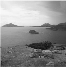
Figure 1.2 View of the Aegean Sea from the cella of the Temple of Poseidon at Sunium.

Why did the Athenians locate a cult of Poseidon at just this spot on the Athenian coast? How were cult sites in general selected? Some sites apparently had a natural mystique. Mountain tops were often sacred to Zeus, the god of the sky and the weather. Springs, the source of the water always in short supply in Greece, and caves almost always attracted cults. Springs and caves were often assigned to the Nymphs. The god Pan, himself often associated with Nymphs, was given a cave on the north slope of the Acropolis when his cult was established in Athens about 490. Artemis preferred rural sanctuaries, also often associated with sources of water. A water source, necessary for medicinal purposes, may have played a role in locating Asclepius' sanctuary on the south slope of the Acropolis in 420/19. Places touched by the gods themselves, as by Zeus with his lightning or by Poseidon with his trident on the Athenian Acropolis, also became sacred. By contrast to these naturally numinous places many cult sites, especially in urban areas, seem to have been selected based on the deity's function. Athena, the armed patroness and protectress of Athens, had her major sanctuaries on the Acropolis, the city's fortified citadel.