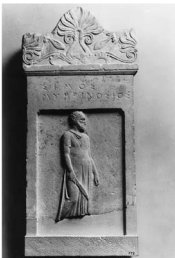
Figure 1.5 The tombstone (.62 m. high) of the Athenian priest Simos of the deme Myrrhinous, dating from 370–360 B.C.E. His priesthood is indicated by the sacrificial knife he carries and by his long, unbelted garment. inv. no. 772.

Let us imagine at this early stage a rather simple festival day for Poseidon at Sunium. For all Athenians the eighth day of each month was sacred to Poseidon, and let us put his annual festival day on the eighth day of the month Posideon. This, the sixth month of the Athenian year, fell in mid–winter and was named, like most Greek months,