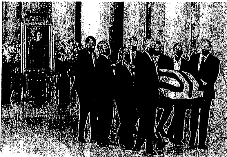
The flag-draped casket of Justice Ruth Bader Ginsburg, carried by Supreme Court police officers, arrives in the Great Hall at the Supreme Court in Washington, Wednesday, Sept. 23,... Read more

Following the death of 87-year-old RBG, some wonder if lifetime appointments still make sense for the highest court in the country.